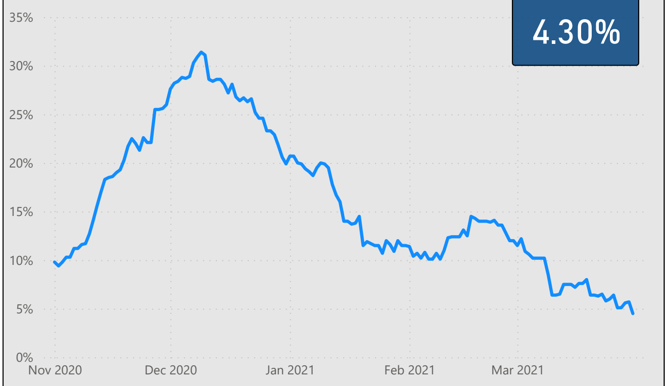
CASE RATE PER 100K